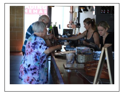
March monthly outing (late change) at the BrewVino Mandurah