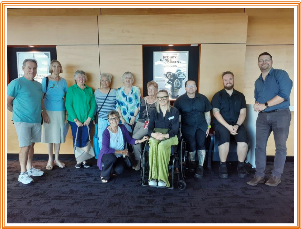
Photo – Members of the Lip Reading class and MANPAC technicians

We learned that Hearing Loop and Bluetooth are entirely different systems. Both use wireless technologies, Bluetooth is a short range signal, a Hearing Loop has no range limit but one needs to be 'In the Loop' area to be able to use it. Both the Lip Reading group and MANPAC technicians were learning from each other, and further information is needed by both to enhance the experience for theatre goers.