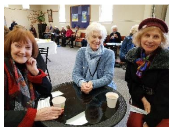
Some of our members enjoying morning tea