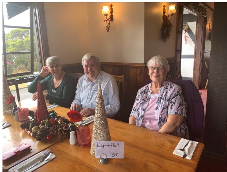
Some photos from our wonderful Christmas in July