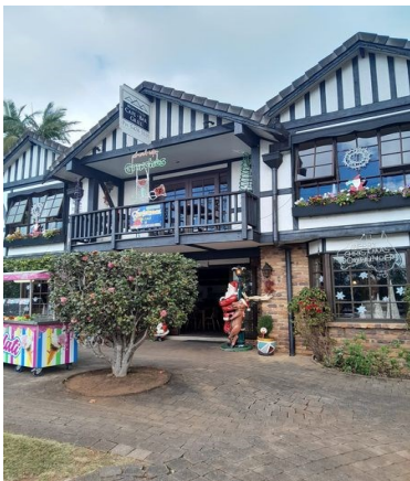
PICTURE OF THE VENUE OF OUR CHRISTMAS IN JULY, THE MONTVILLE PUB.

REMINDING YOU ALL OF FREE CONCERTS AT THE BRISBANE TOWN HALL EACH TUESDAY 12.00 - 1.00PM