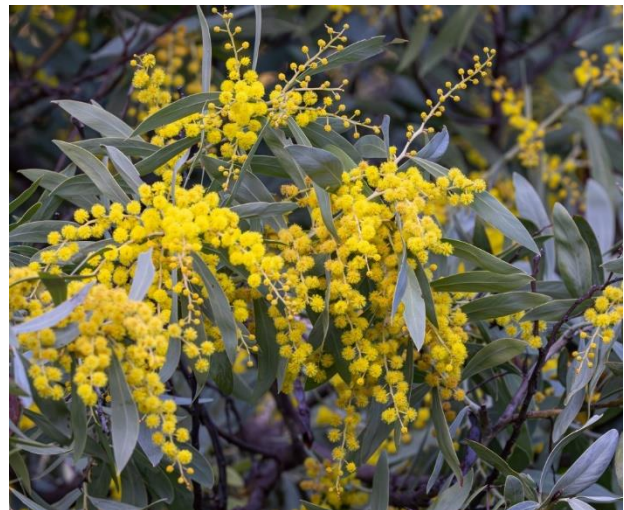
A Kings Park wattle

Subsidised Rottnest Ferry tickets. If you have a WA Seniors card you can book a day return trip to Rotto with either of the ferry operators for $30 up until Sunday August 18 th , courtesy of the WA Government. Accommodation is not included.