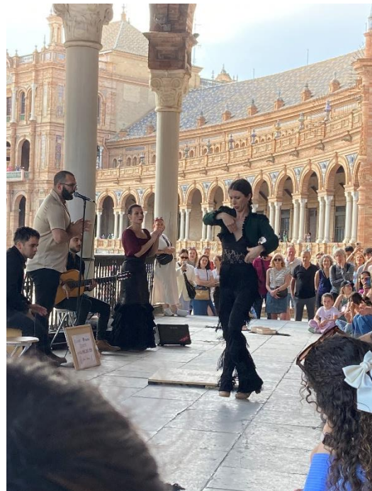
Flamenco at Plaza de Espana, Seville

In Seville, once again, too many tourists so could not get into the Alquavir or cathedral but walking the corniche on the Rio Guadalquivir was pleasing and the magnificent Plaza de Espana is a stunning 1920's Spanish/Moorish revival palatial central building complex in sculpted terraces and fountained lakes in extensive gardens. We were fortunate to happen on an impromptu exhibition of flamenco dancing and music in a forecourt. This part of the city is orange tree-lined, giving rise to delightful aromas.