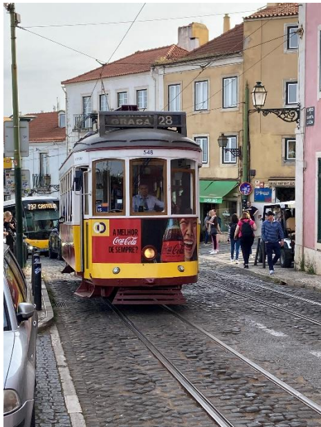
The renowned No 28 tram, Barrio Alto

The hilly, town of Sintra, an hours train-ride west of Lisbon, although also tourist plagued, provided pleasant forest walks and a trek up to a very scenic Moorish hilltop site fort. Fortunately, after our >10,000 steps, we picked up a bus to the train station, thence back to Lisbon for dinner of the national dish – sardines.