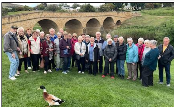
Group & 'feathered intruder' in front of bridge built by convicts