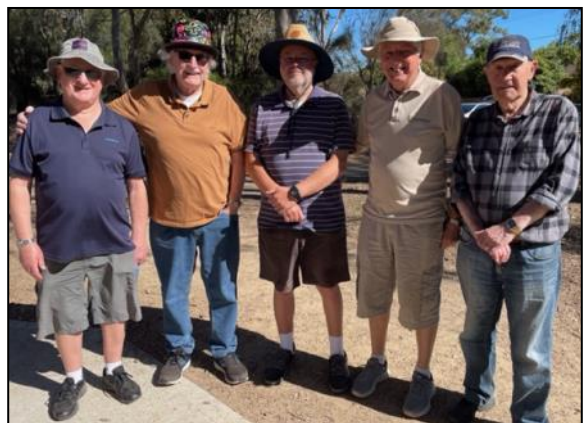
Our Walking Group wearing their hats for Cup Day