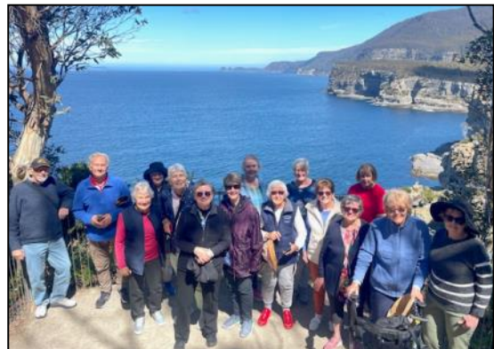
Group on Bruny Island