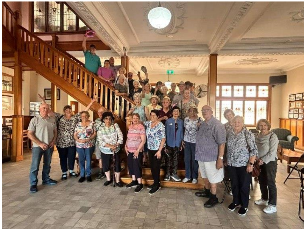
Corones Hotel Charleville