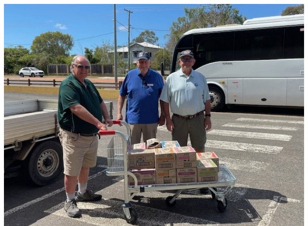
Bundaberg travellers loading up with Ginger Beer

Please don't forget to check our Photo Book [with many thanks to Julie Baldwin] at our meetings. You choose and order the photos you want at no cost to you.