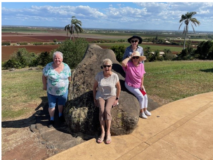
Views from “The Hummock” Bargara.