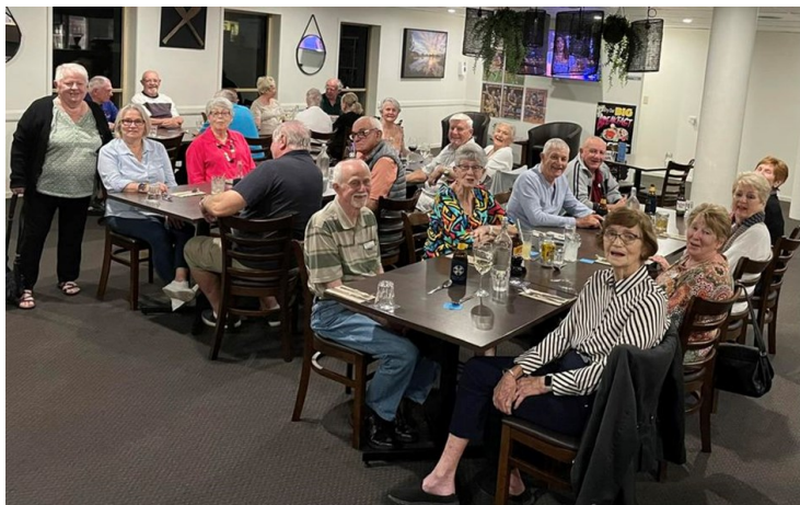
Here is a happy group waiting for their dinner to be served on the first night of the Bundaberg trip.

Non-Email Members will have a copy of the newsletter reserved for them for pick up at the entry desk. The Newsletter is also available online at ( nationalseniors.com.au/getinvolved/branches/forest-lake ) & on our Facebook group page “Forest Lake Branch National Seniors Australia Group” If you are on Facebook go to the Branch Facebook Page (Forest Lake National Seniors Australia) and click on “Join Group”