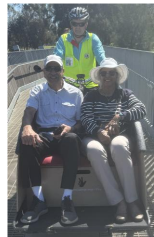
3 - Deep and Giselee