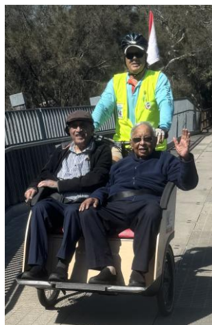
2 - Two Old Patriarchs on a Bike